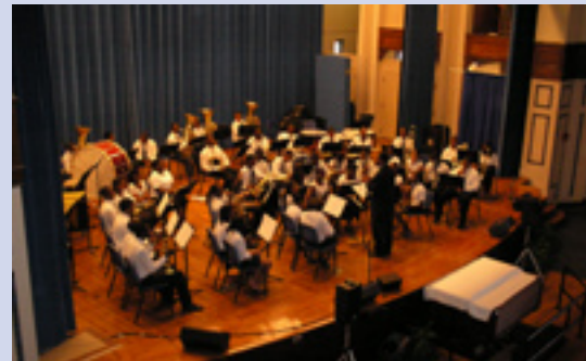
HUBC 2006 Concert Band

The Marching Band portion of the camp is designed to provide instruction in show-style marching band performance. The music selected for this ensemble includes but is not limited to popular music from the top of today's charts. As a culminating activity, the Marching Band is featured during halftime at the Virginia All-Star High School Football Game.